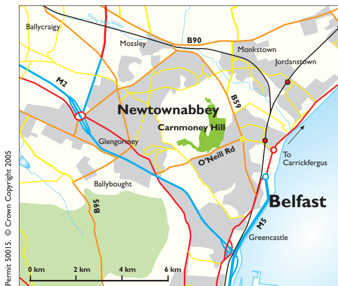
Permit: 50015.

Number 64A Metro Bus from Belfast City to O'Neill Road; number 2D/E/F Metro Bus from Shore Road, Belfast to Doagh Road. Telephone Translink on 028 9066 6630 for times.