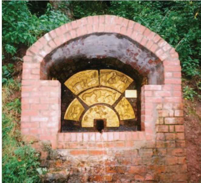
Restored Victorian well

Carnmoney Hill is one of a chain of hills, steeped in history and folklore, which watch over Belfast City. The name Carnmoney gives us a clue to its history; it's from the Irish Carn Monaidh, meaning 'cairn of the bog'. There may have been a cairn, or stone-pile, on the hilltop, which could place man's influence on Carnmoney Hill as far back as the Bronze Age, two thousand years ago. Two Souterrains (man-made underground tunnels) have also been found on the Hill. These were probably used as escape routes from Vikings and other raiders.