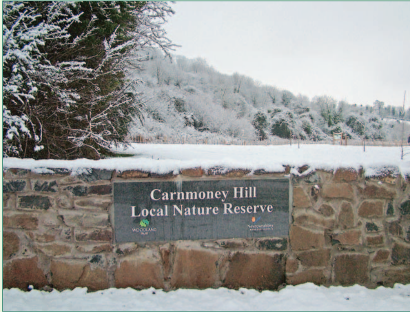
Belfast Hills Partnership